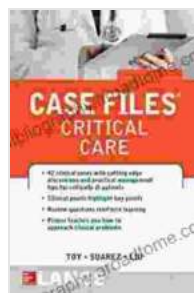
Case Files Critical Care (LANGE Case Files) by Eugene C. Toy