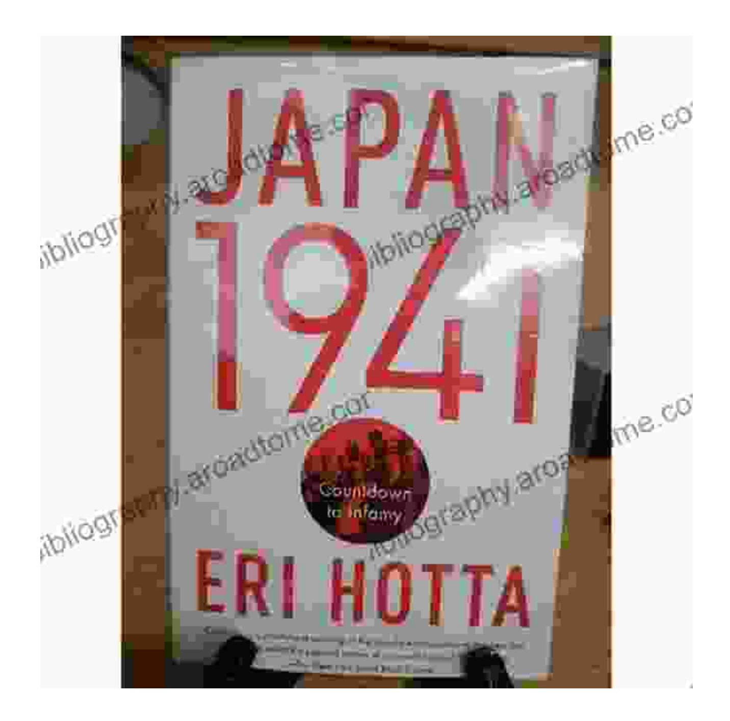
Delving into the Heart of a Nation's Descent into War